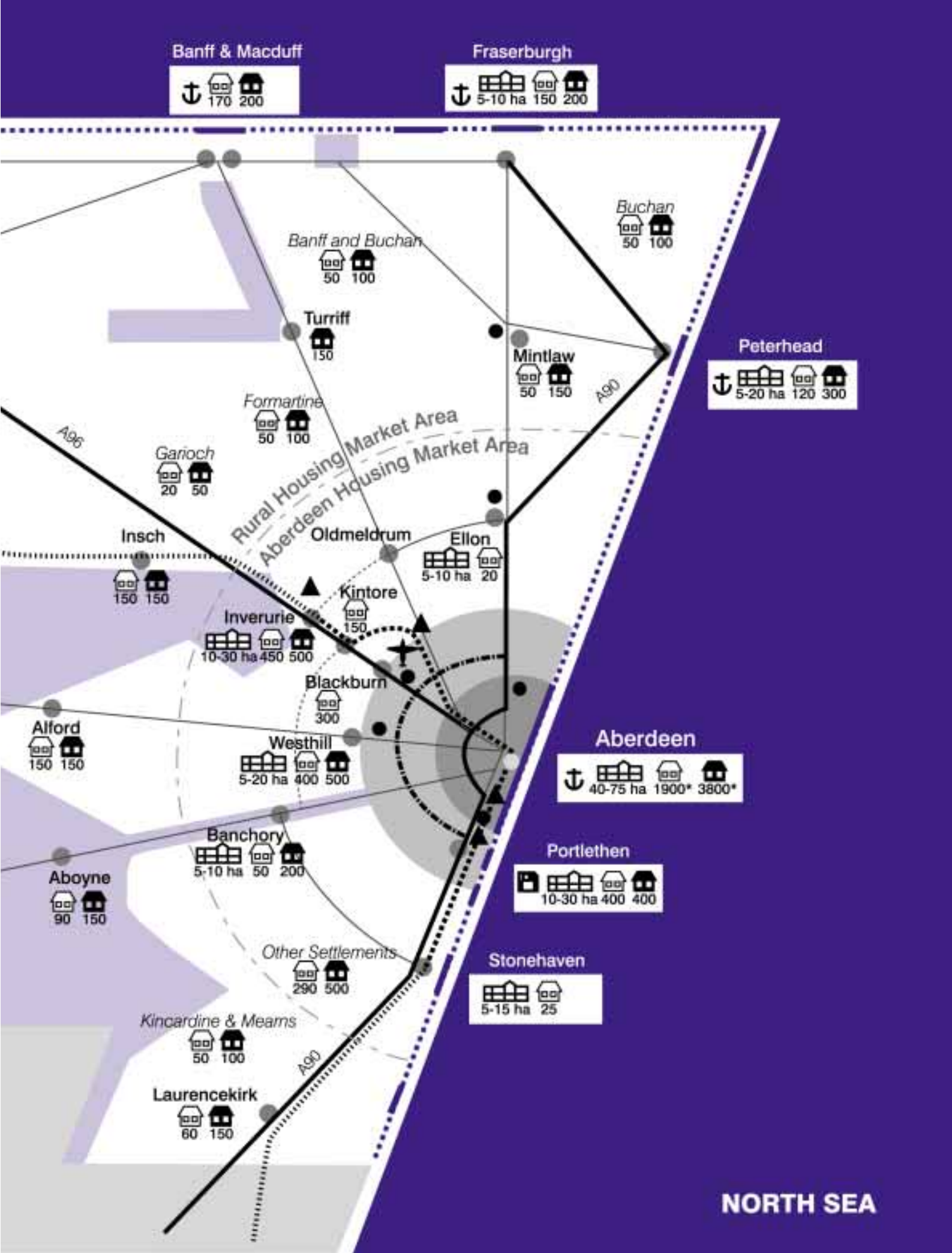
Finalised Aberdeen & Aberdeenshire Structure Plan Key Diagram